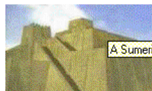
A Sumerian ziggurat